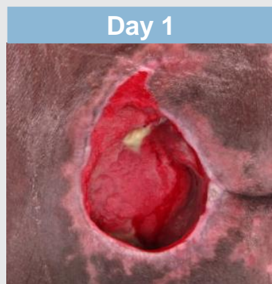
Before OASIS application

At 9 weeks, the wound reduced from 13 x 8 cm (with undermining) to 9 x 6 cm (with undermining). At this point, the patient was closed using a bilateral gluteal myocutaneous advancement flap.