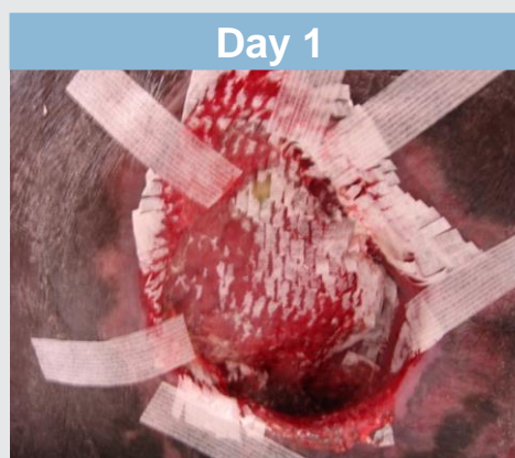
Initial OASIS application