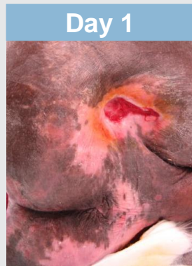
Right ischial ulcer before OASIS application

At 6 weeks, the left ischial ulcer was closed using a total of five applications of OASIS. At 7 weeks, the right ischial ulcer was closed using a total of six applications of OASIS.