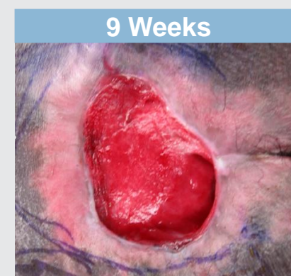
9 weeks following initial OASIS application, prior to flap procedure

Note: Individual results will vary. OASIS Wound Matrix is the product name in the U.S. OASIS Extracellular Matrix is the product name outside the U.S.